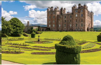
Drumlanrig Castle, Scotland